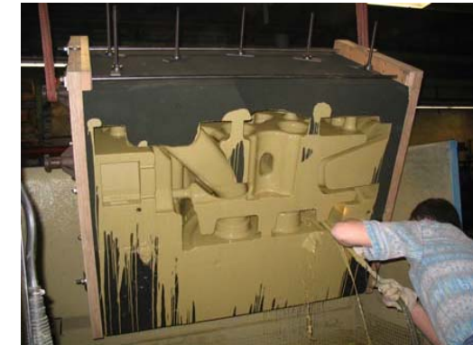
Simple treatment of the mould