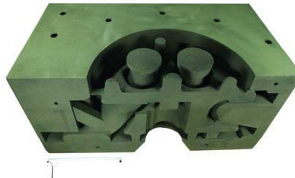
half of the mold