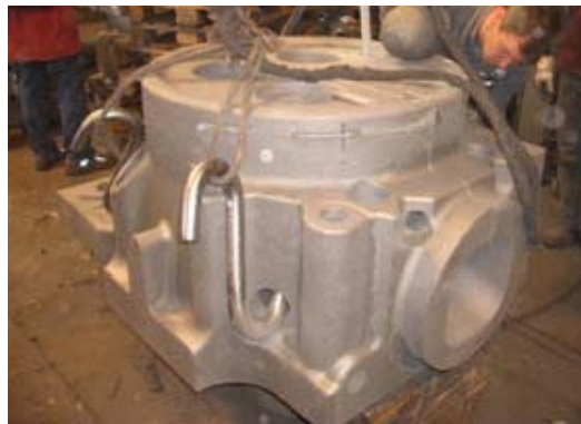
Rough cast after blast treatment Weight: 2100 kg